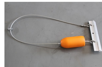
Tow and Anchor Bridle (not included)

Step 5: Tow the curtain out into position. A tow and anchor bridle (not included) is recommended for this application to help evenly distribute the weight. Keeping the bottom draft tied up will help to ease the towing process and make it easier to maneuver.