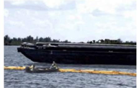
Installed Floating Boom

For additional information regarding your curtain design, layout, or deployment method, please contact your local technical representative.