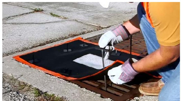
Step 6: Position the fastener assembly so the block is perpendicular to the slot and can't be pulled out. Keep the tie taut with one hand and push down the rubber washer with the other.

See instructions continued on next page.