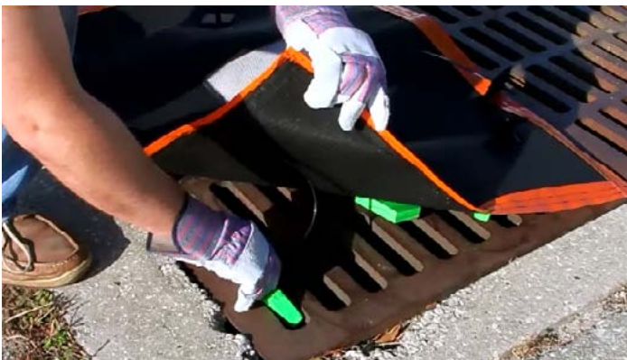
Step 5: At the bottom of each fastener assembly is a block. Insert each block into its corresponding slot in the drain.

These support rods will fit between the pre-installed support rods to create a snug “locked” fit.