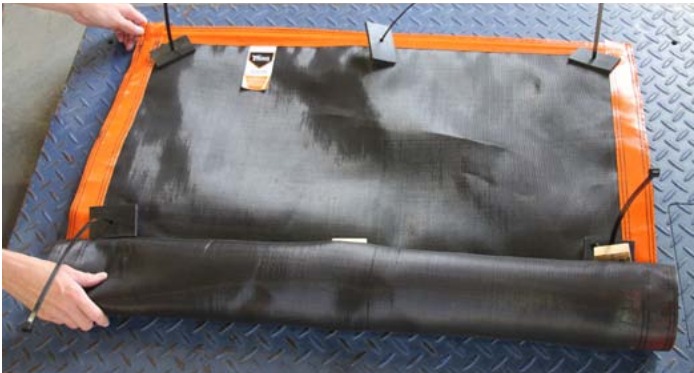
Step 1: Unroll the filter on a flat surface.

Note: If your Taurus Over Grate Filter comes to you “flat”, please skip to step 5.