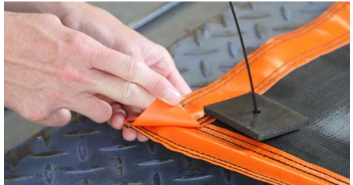
Step 2: Locate the two corners that are NOT closed/sewn.