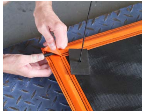
Step 3: Insert one of the included support rods in the opening threading it all the way into the sleeve.